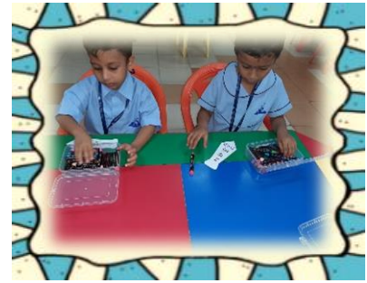
Father's Day activity

Art and craft is so much fun! It also improves the eye-hand coordination. This is an important skill as it strengthens the fine motor muscles and helps the students develop better control. Children made ties for their dads, learnt finger dabbing. Leaf printing also allowed the children to explore and experiment with different size and shape of leaves that grow in the vicinity. They were thrilled by the unique prints that each leaf left behind in their books.