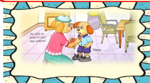
Pepper Goes to School