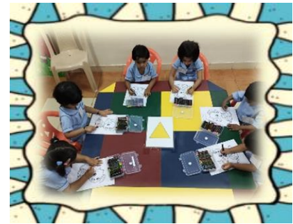
My First Colouring

Art and craft is so much fun! It also improves the eye-hand coordination. This is an important skill as it strengthens the fine motor muscles and helps the students develop better control. Children made ties for their dads, learnt finger dabbing. Leaf printing also allowed the children to explore and experiment with different size and shape of leaves that grow in the vicinity. They were thrilled by the unique prints that each leaf left behind in their books.