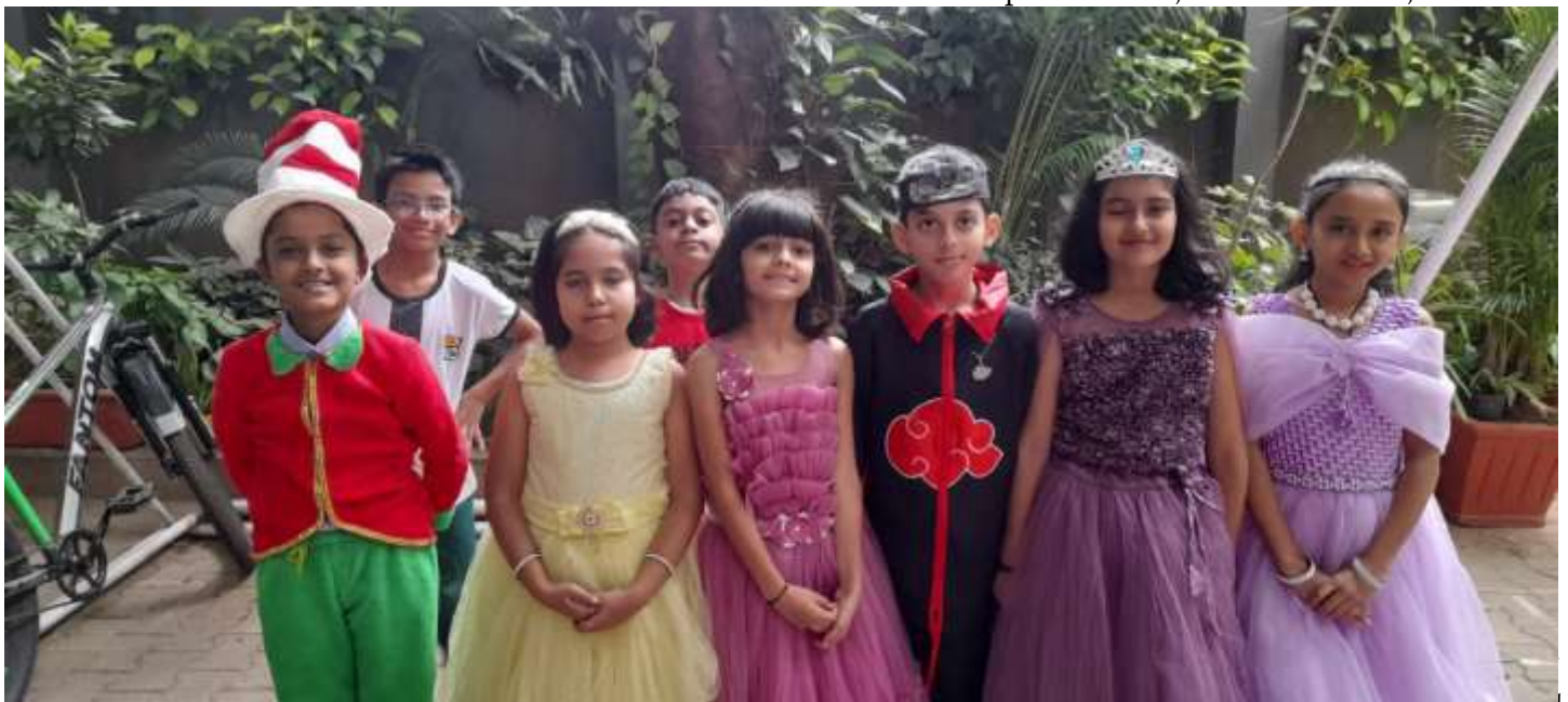
by Sarinak and Mustaqim. The assembly highlighted