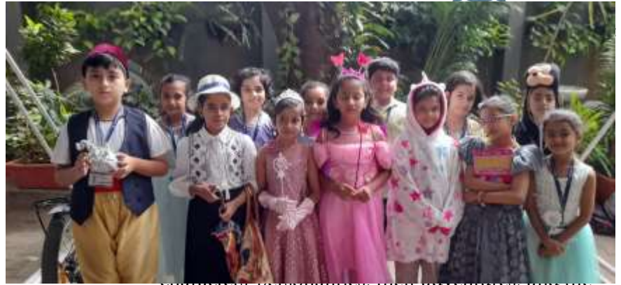
characters, personalities, their adventures, and the

29/07/2024 LAR Competition It was an engaging and vibrant event! Bringing storybook characters to life with such enthusiasm and skill must have been a wonderful experience. It's great to hear that they spoke with volume effectively. Additionally, learning to appreciate the skills of their fellow participants is an invaluable lesson in teamwork and mutual respect.