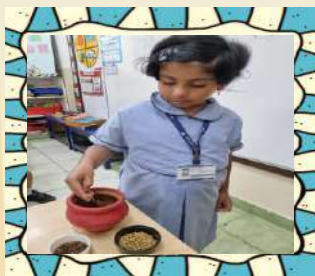
Sowing a seed

Community Helpers are important, because they make our lives better, keep us and our community safe and help our community function better. Students were introduced to the various community helpers – Cobbler, Painter, Postman, Builder, Tailor, along with the tools used by each of them. Nature is the best teacher a student can have. Students learnt about the various aspects of nature during a Nature Walk. Concepts such as – Parts of a plant, Leafy vegetables, Root vegetables and flowers were introduced to the students