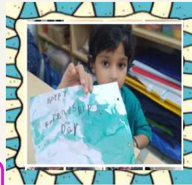
Friendship Day Card

Art and craft activity engages children's sense of touch, sight, and sound, and helps develop their fine motor skills and hand-eye coordination. As a part of class activities, children enjoyed rolling strips of papers to make a beautiful flower, using ice cream sticks. They made Indian flags and also beautiful friendship day cards for their friends.