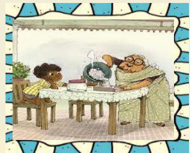
Ammachi's Amazing Machines