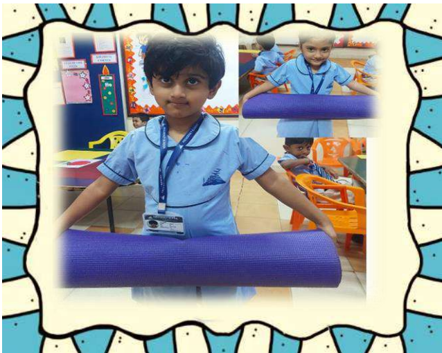
Carrying the Mat

Description Music and movement provide children with so many benefits. They help children develop skills such as cognitive growth, problem-solving, self-expression and social development. A child's learning is incomplete without music and movement in early childhood education.