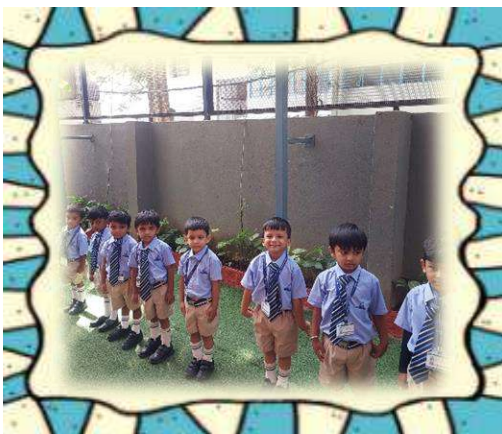
Standing in line