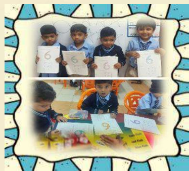
Topic: Number 6

Recapitulation of basic shapes like circle, square, triangle and rectangle helped tiny tots to identify and differentiate shapes and also encouraged children to think critically, allowing them to express creatively in various art forms. Identifying and understanding numbers lays the ground for basic math skills. Number 6 was introduced with various activities, which was engaging and fun-filled at the same time. This helped them understand that each number corresponds to specific quantity.