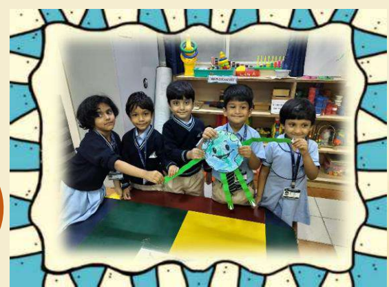
Topic: Earth and Environment