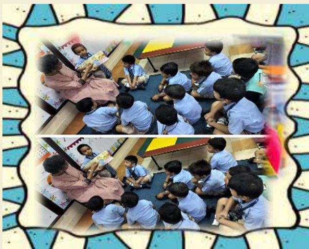
Bruno Learns to Share