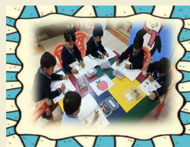
Topic: Letter N

Recognizing letters and understanding letter sounds form the basis of reading and writing. Learning letter sounds help tiny tots to identify and manipulate sounds in words. Students were introduced to letter N and M with various activities, which helped them in identifying and writing letters N and M. They also were introduced to zigzag lines, enhancing their ability to form patterns and shapes.